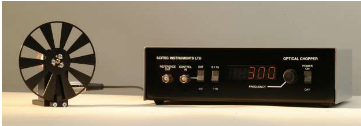
↓ Model 300CD